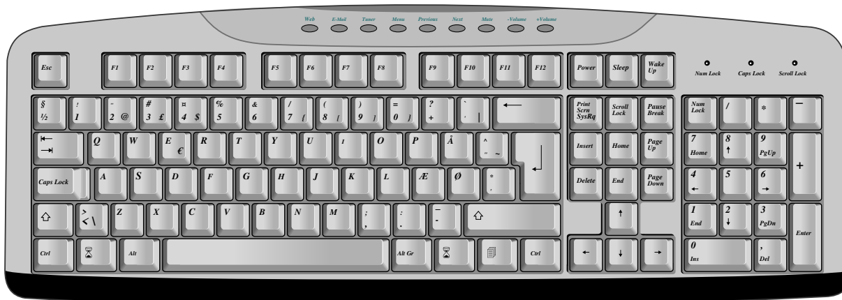
Figure 2: This figure floats to the top of the page, spanning both columns.