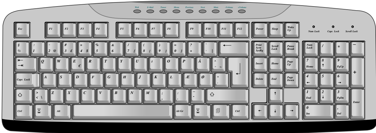
Figure 2: This figure floats to the top of the page, spanning both columns.